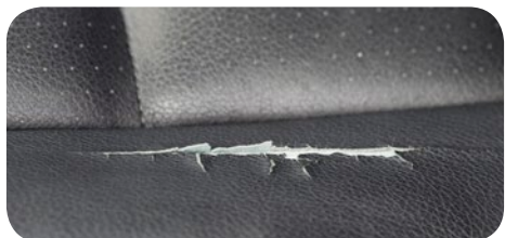
Interior cuts, burns, or stains

Covered excess wear and use items must be within plan limits.