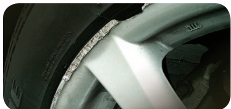
Damage to tires, rims or hubcaps