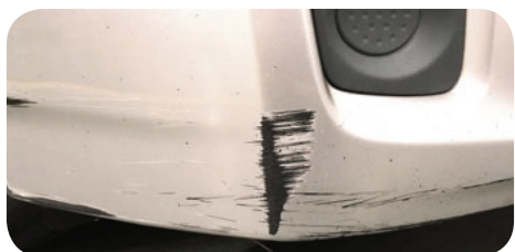
Damaged bumpers, body dents, dings or scratches