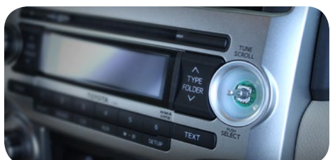
Missing parts or equipment