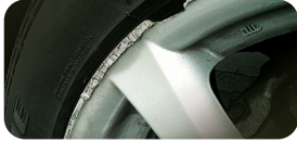
Damage to tires, rims or hubcaps