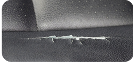
Interior cuts, burns, or stains

Covered excess wear and use items must be within plan limits.