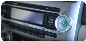
Missing parts or equipment