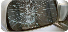
Broken or scratched windshield, windows, mirrors or lights