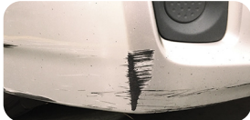
Damaged bumpers, body dents, dings or scratches